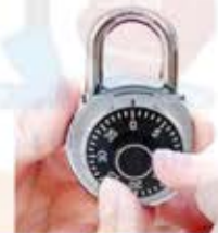
Turn the wheel to the corresponding password.