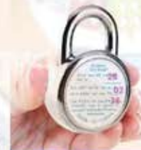
Take out the password paper.