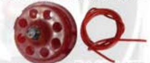
KRM-K-RMCLT-8C (2 MTR CABLE WITHOUT LOOP)