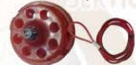
KRM-K-RMCLT-8CL (2 MTR CABLE WITH LOOP)