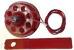
KRM-K-RMCLT-8CLWT (WITH CABLE & LOCKING DEVICE)