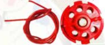
KRM-K-RMCLT-6C (2 MTR CABLE WITHOUT LOOP)