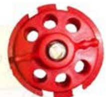
KRM-K-RMCLT-6-R (WITHOUT CABLE)