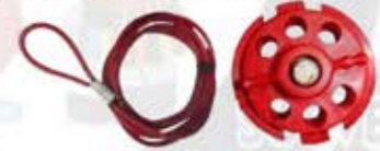
KRM-K-RMCLT-6CL (2 MTR CABLE WITH LOOP)