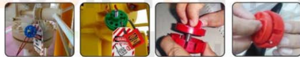
KRM-K-RMCLT-6 with 6 holes on the top & 8 Holes on the Bottom